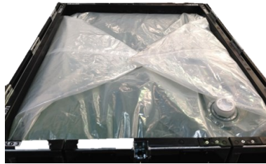
1000L liquid capacity subject to specific gravity of product.